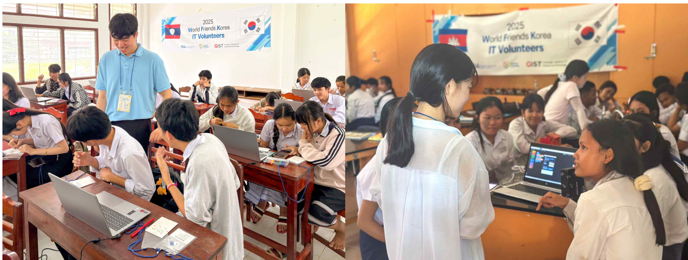
▲ The 2025 World Friends Korea IT Volunteer Group is teaching local students at their designated institutions (Vang Vieng Ethnic School and Sarsardam High School).