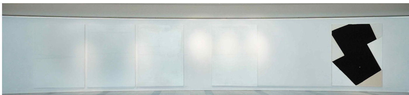
▲ Main work on the first floor of the 3rd Oryong Art Hall in 2025

A total of 27 works will be exhibited in this Oryong Art Hall invitational exhibition, continuing the tradition of minimalist paintings centered on achromatic colors in the late 1990s, while the expanded possibilities of abstract paintings newly built on top of it are at the center.