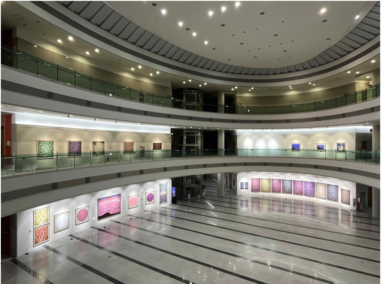
▲ The Oryong Art Hall where the 1st invitational exhibition 'Rise as an island and bloom as a flower' is being held

「Oryong Art Hall」 was created in the form of an art gallery using the inner walls of the 1st and 2nd floors of Oryong Hall. From 9:00 am to 6:00 pm on weekdays and weekends, it was created as a space where anyone can enter Oryong-gwan and enjoy the various art works displayed on the first and second floors without restrictions.