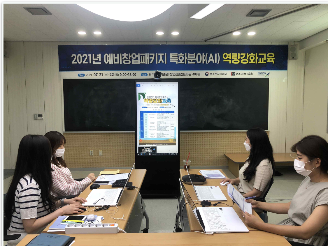
▲ Preliminary Start-up Package Specialized Field (AI) Competency Reinforcement Training in 2021