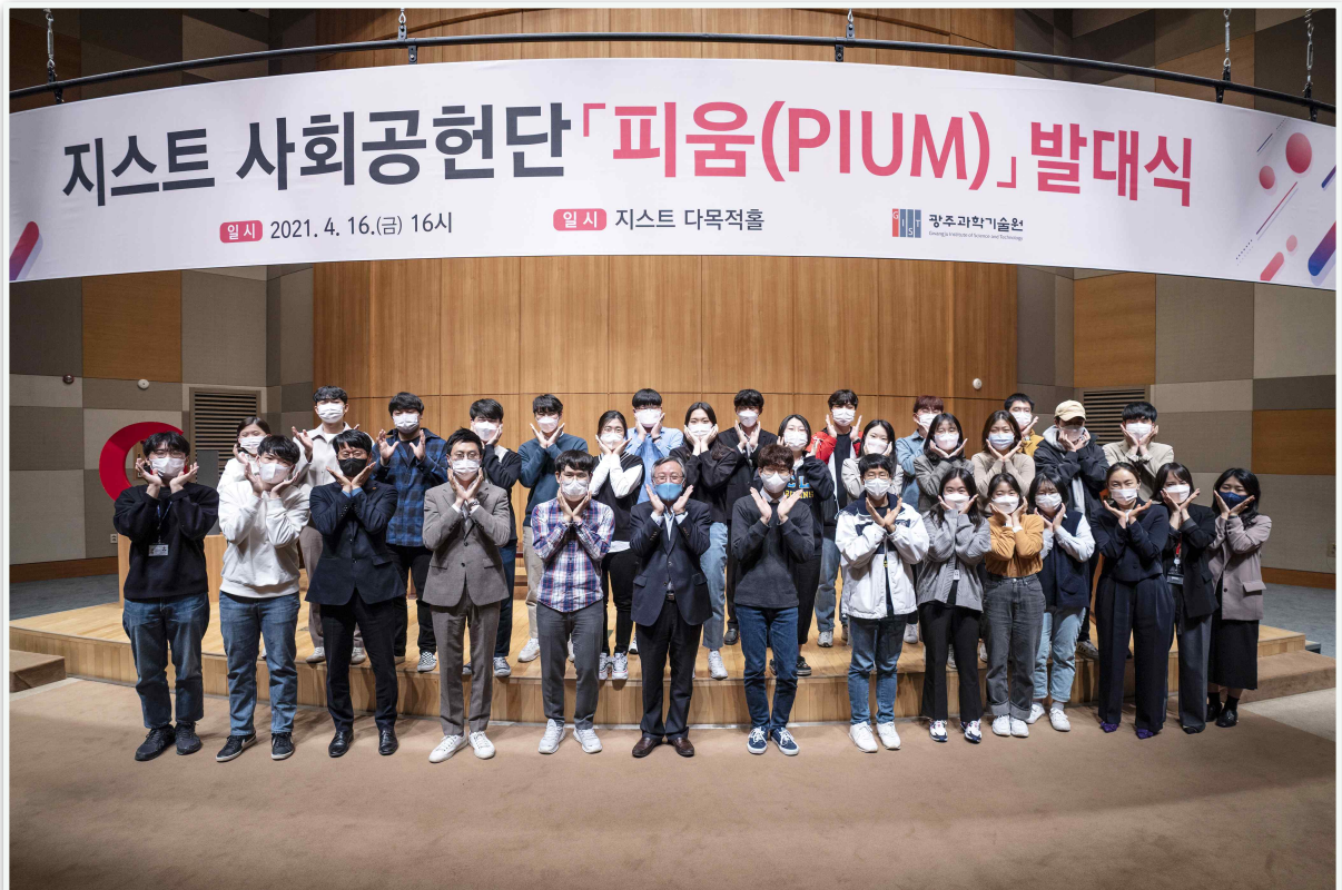
▲ Inaugural ceremony for the GIST social contribution group "PIUM"