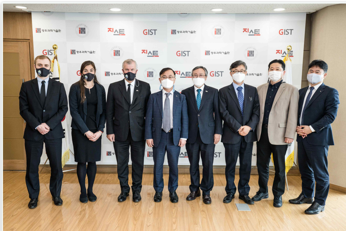
▲ Photo 2. Commemorative photo of the visit to GIST by the British Ambassador to Korea