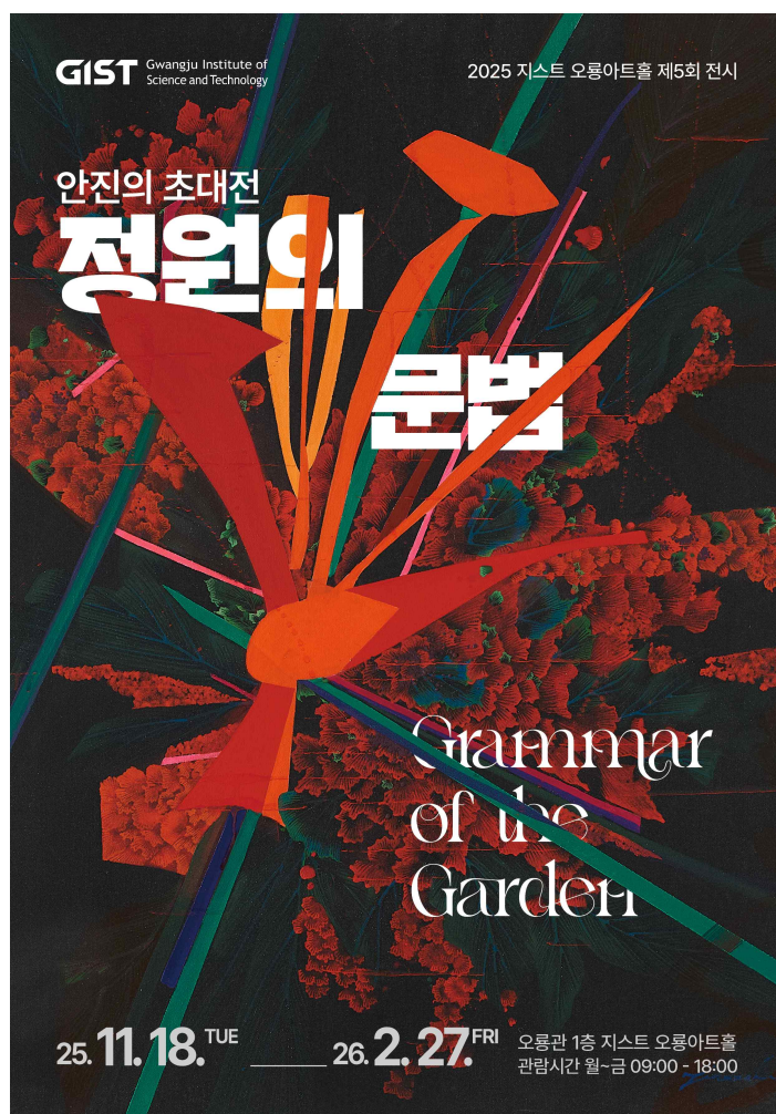
▲ Poster for the 2025 Oryong Art Hall 5th Exhibition