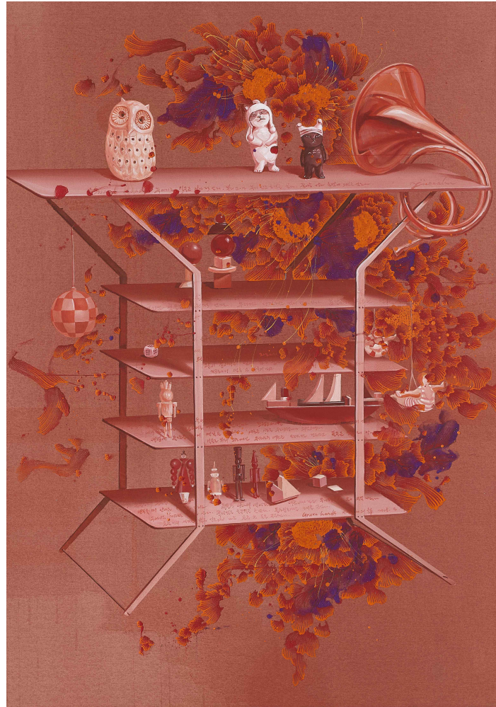
▲ 2025 Oryong Art Hall 5th Exhibition Works (The Time of Flowers_Dreaming Bookshelves, 130.3 x 97cm, mixed media with stone on canvas, 2025) Bookshelf (The Time of Flowers_Beyond Bookshelves, 130.3 x 97cm, mixed media with stone on canvas, 2025)

This exhibition is open to the public from 9:00 AM to 6:00 PM on weekdays. A "Meet the Artist" event open to the public will also be held on Thursday, December 4th. (For inquiries about the exhibition and weekend visits: ☎ 062-715-2622)