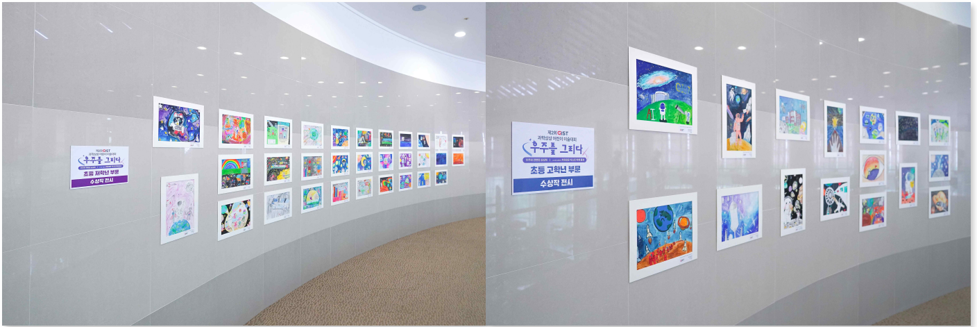
▲ Elementary school lower grade category winners

Meanwhile, following the successful 1st Science Imagination Children's Art Contest held last year, GIST also held the 2nd contest, which was designed to spread the values of sharing and regional coexistence, with great interest and participation from the local community.