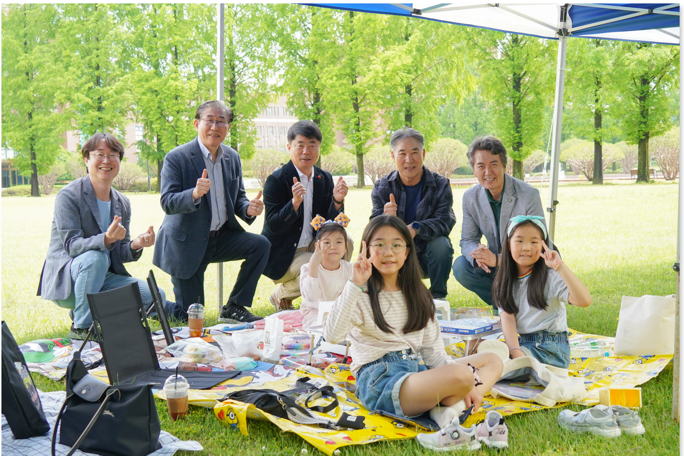
▲ GIST held the '2nd Science Imagination Children's Art Contest' with the slogan 'Drawing the Universe' in the Oryong Hall area on Saturday, May 17.