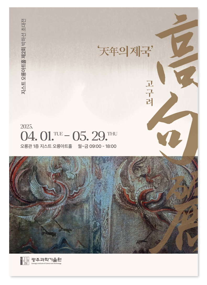
▲ Poster for the 2025 Oryong Art Hall 2nd Exhibition 'Goguryeo'

- Ha-seon Park, who has established a unique position as a documentary photographer by recording life and culture in remote and conflict-ridden areas around the world, explores Goguryeo ruins over a 10-year journey... until May 29th