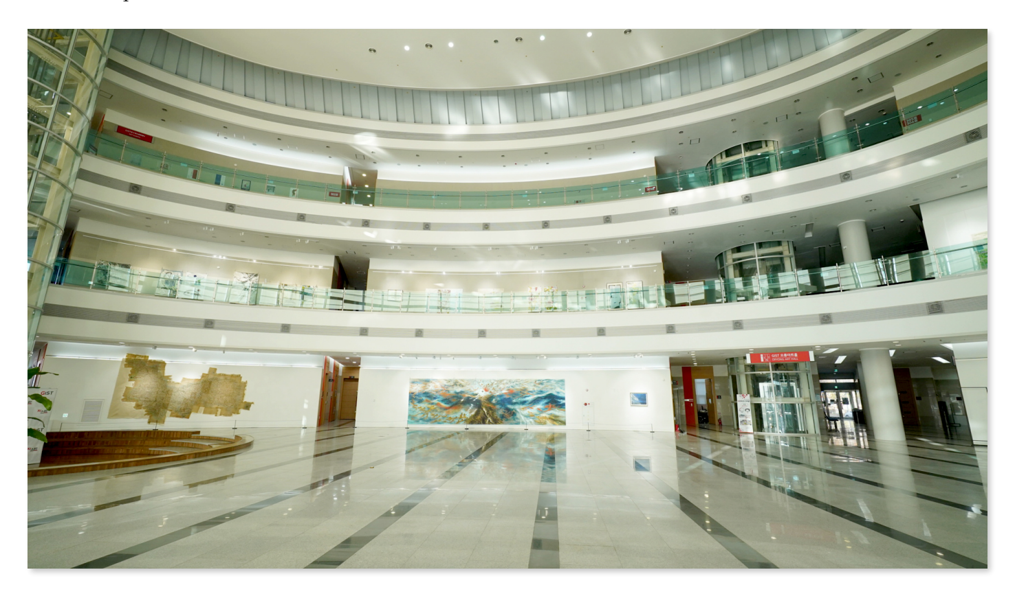
▲ Panoramic view of the 2024 Oryong Art Hall 7th Exhibition at Oryong Art Hall

This exhibition is the seventh invitational exhibition held at Oryong Art Hall this year, and it will display about 20 works that delicately combine materials such as old Korean paper, colorful threads, and hemp to create unique and rich forms and emotions.