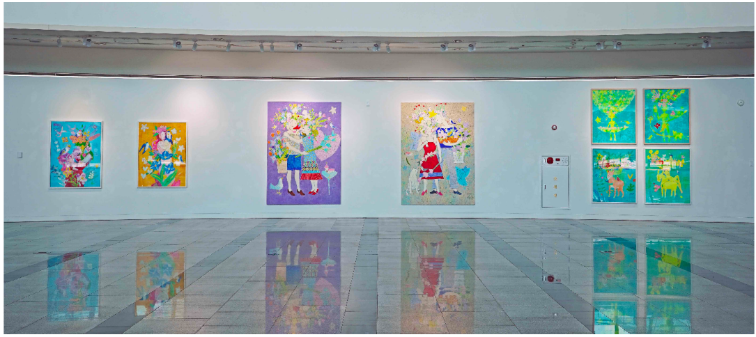
▲ The lobby on the first floor of Oryong Art Hall, where the 5th exhibition 'Flower Friends' of Oryong Art Hall 2024 is being held