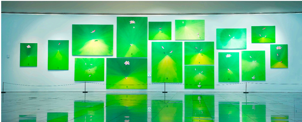
▲ Oryong Art Hall 1st floor lobby where the 2024 4th exhibition 'Breath: Rest' is taking place

'I reflect on myself as I encounter tree frogs that often appear before my eyes without me knowing when. How does a small and delicate life view the world? What should we live for? ... (omitted) The indifferent gaze looks like that of a practitioner. Watching these very small changes suddenly gave me rest, and while having silent conversations with them, I realized that breathing became each other's breath and rest. - From the author's notes