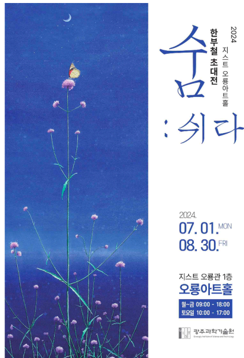
▲ 2024 Oryong Art Hall 4th exhibition 'Breath: Rest' poster

In particular, the 'Breath' series, which is also the theme of the invitation exhibition, is an ambiguous expression of 'breathe' and 'rest', providing viewers with a sense of peace where they can put aside what they are doing and take a break. In addition, other works divided into 'contain', 'look', and 'think' reflect artist Bu-cheol Han's journey of artistic activity and reflection on humanity.