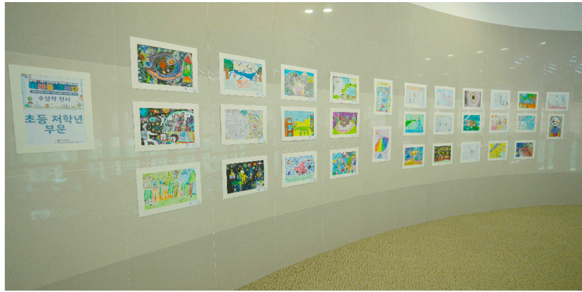
▲ GIST 1st Science Imagination Children's Art Contest Winner in the lower elementary school category