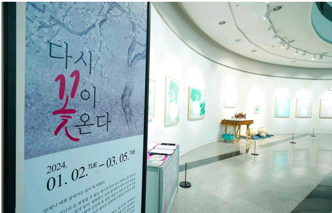
▲ GIST Oryong Hall, where the 2024 Oryong Art Hall 1st invitational exhibition <Flowers Come Again> is being held