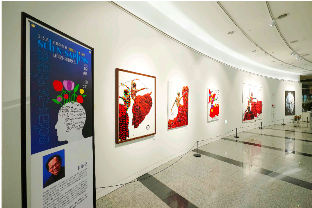
▲ Panoramic view of the 'Science-Sapiens' invitation exhibition on display at Oryong Art Hall