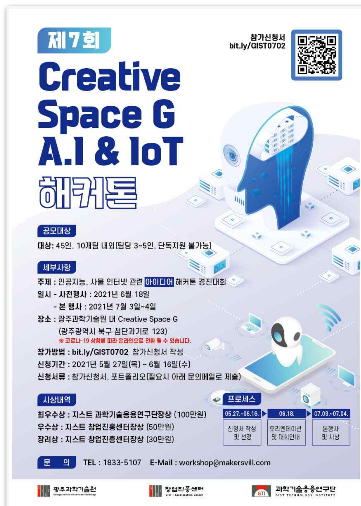
▲ 2021 GIST promotional poster