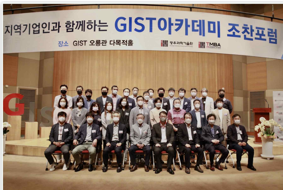
▲ GIST Academy May Breakfast Forum