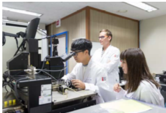
▲ 2018 GIP Intern participates in a joint research project