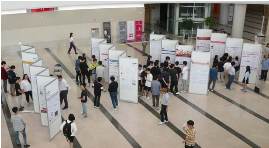
The 2018 G-SURF Poster Session