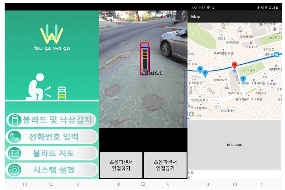
▲ [Picture 1] From the left, the main screen of the app, bollard real-time detection AI technology, and bollard map screen