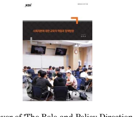
▲ Cover of 'The Role and Policy Direction of Education on Social Capital'