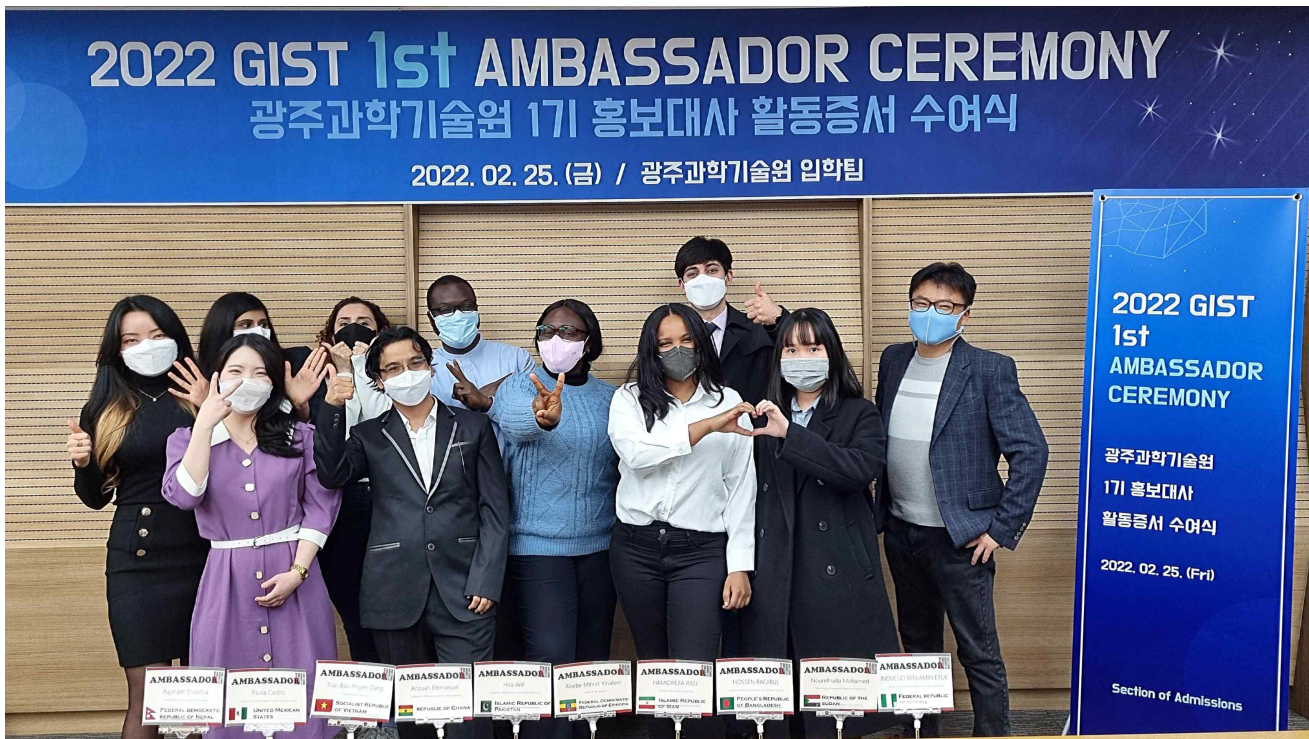
▲ Photo 1_Group photo of "GIST 1st Foreign Ambassador Activity Certificate Award Ceremony".