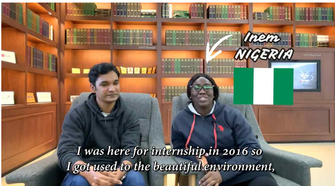
▲ Photo2_ Part of "Promotion Video 1-Interview"